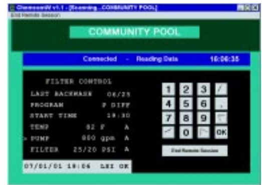
REMOTE COMPUTER OPERATION

Each unit is supplied with a comprehensive operation manual, on-site startup and training by a Qualified Dealer, plus a FIVE-YEAR electronics warranty .