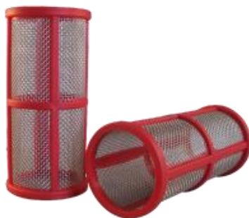
20 Mesh 915 micron