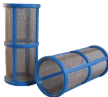
50 Mesh 304 micron