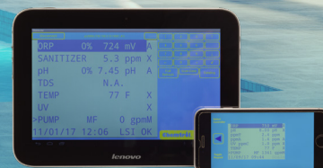
Remote Computer Operation